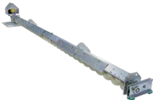
— Photo of CST sweep auger