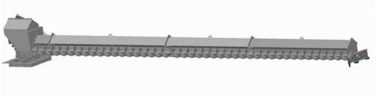
— Dwg of CST sweep auger