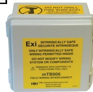
Field Interconnect Boxes (x4)