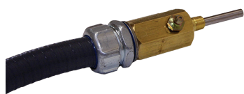
Bearing Temperature (x4)