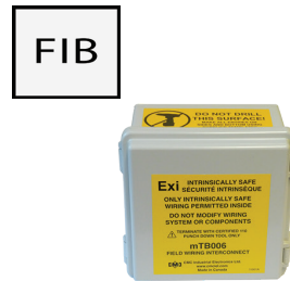
Field Interconnect Boxes (x2)