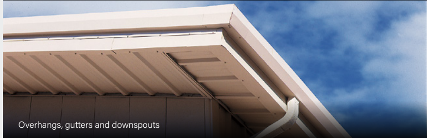
Overhangs, gutters and downspouts