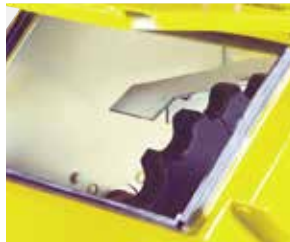
Easily replaceable head carryback (or chain stripper)