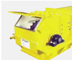
Hinged relief door for conveyor protection

All wear parts are easy to replace making the conveyor very maintenance friendly.