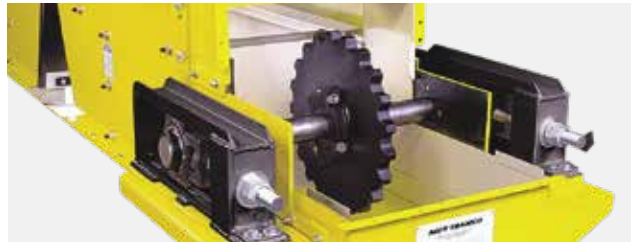
Double-Life and Walking Tooth sprockets are available. Walking Tooth sprockets are only available in 6" pitch chain. However, Double Life sprockets are applicable for any pitch chain with an even number teeth.