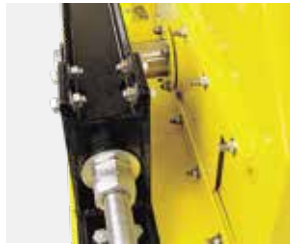
Heavy-duty center pull takeup frame. Packing gland shaft seal