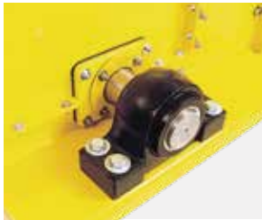
Heavy-duty, long life pillow block roller bearing Packing gland shaft seal