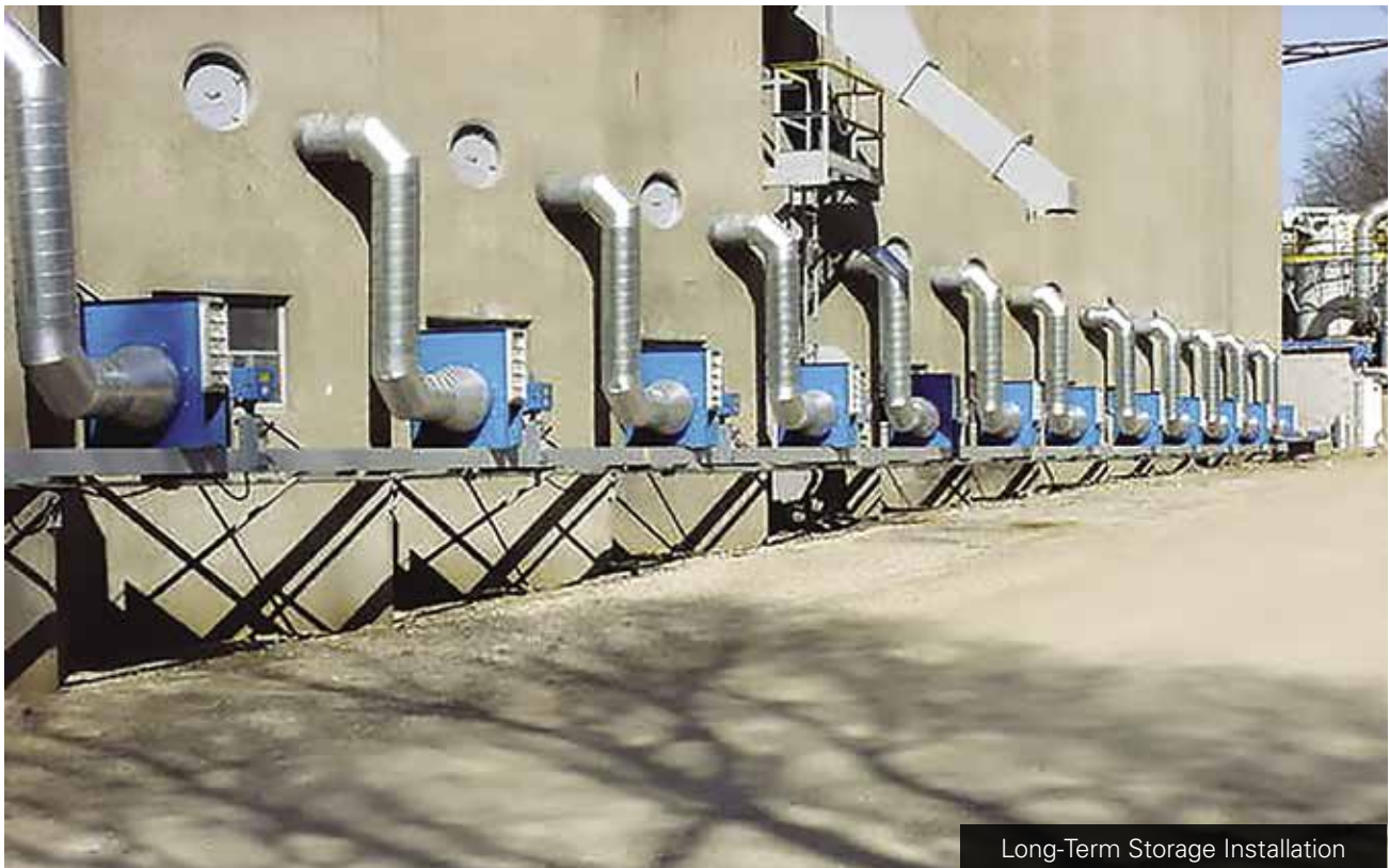
Long-Term Storage Installation