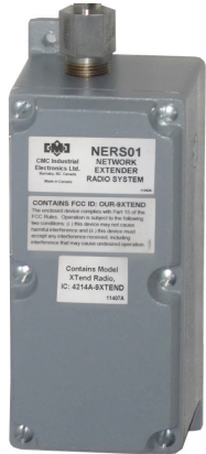
Network Extender Radio