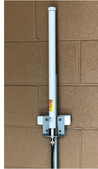
Optional OMNI Antenna