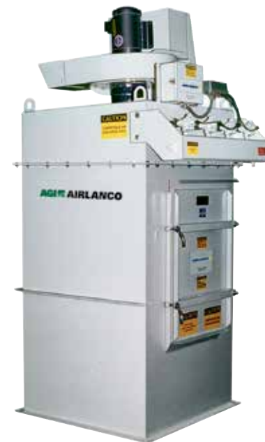
AVS Pulse Jet

Due to the pleated, washable spun bond polyester filters, the E-86 Series Cartridge Filter provides high filtration efficiencies in compact housing.