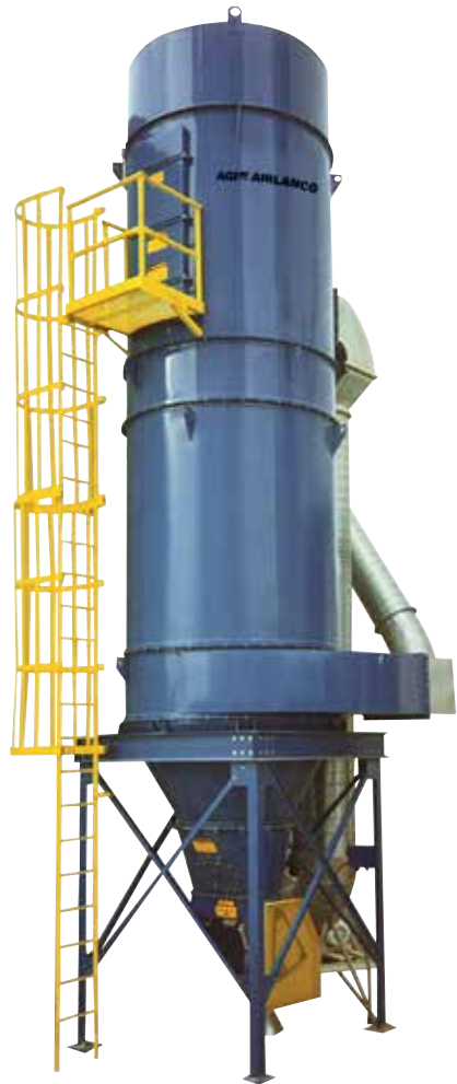
RLP Reverse Air

Low-Pressure Reverse Air Filters have an integral fan to provide thorough and efficient bag filter cleaning without the expense of a compressed air supply.