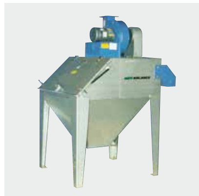
Bag Dump Self-contained AIRLANCO Bag Dump Stations contain a built-in fan and pulse jet cartridge filter for clean and efficient dust removal.

Pneumatic conveying is a common extension of our air management capabilities and an expected choice for moving dry bulk solids efficiently through any plant. Field-proven components used in the filtration systems are essential parts of our pneumatic conveyors. The reliability built into AGI Airlanco's time-tested Airlocks, Pulse Jet Filters and Cyclones is now incorporated into systems you can use to streamline product handling and control dust in new or existing facilities. AGI Airlanco's engineering staff will be glad to demonstrate the tangible advantages of installing an AGI Airlanco Pneumatic Conveying System when an expansion or retrofit of a processing operation is needed. AGI Airlanco equipment can save time, labor and expense, eliminate material handling problems.