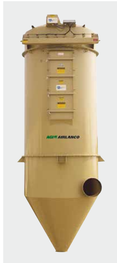
AVR Receiver Pneumatic AVR Receivers are robustly built for high-vacuum operation and feature tangential inlet design and compressed air cleaning of filter media.