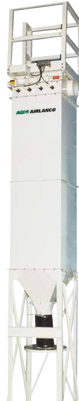
AST Pulse Jet

The AVS Pulse Jet has filter bag access through a side door and can be ordered with a hopper, support legs, ladder, service platform and top or side-mounted fan.