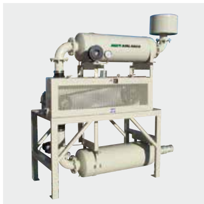
Blower Package Positive Displacement Blower Packages offer a full complement of safety features and silencers. Vacuum, pressure and combination models are available.