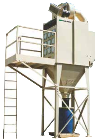
E-86 Cartridge Filter

Low-Pressure Reverse Air Filters have an integral fan to provide thorough and efficient bag filter cleaning without the expense of a compressed air supply.