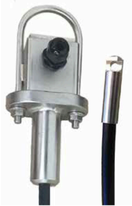
Durable Stainless Steel Head and Tail Sections

COMMERCIAL-DUTY GRAIN TEMPERATURE MONITORING