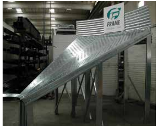
— Photo of FCV28 perforated sheets-