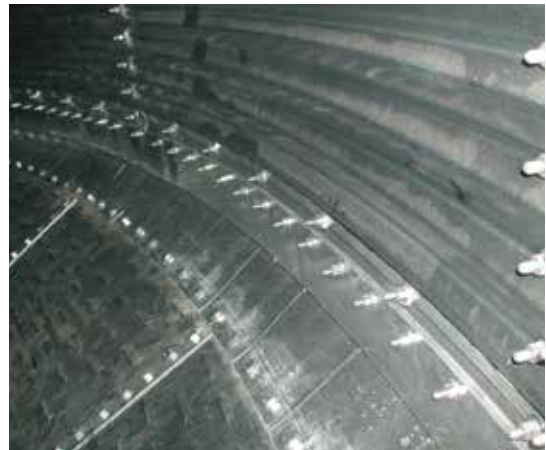
— Photo of FCV28 inside the silo