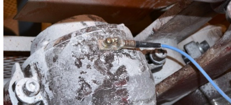
BEARING TEMPERATURE SENSOR ATTACHES DIRECTLY TO BEARING HOUSING SURFACE USING BRASS ZERK FITTING