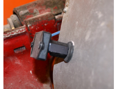
INFRARED SENSOR READS ROLL SURFACE TEMPERATURE

THE EZS 128 CONTROLLER HAS AN INTUITIVE TOUCH SCREEN DISPLAY AND PROVIDES ALARMS AND MACHINERY SHUTDOWN FOR UP TO 10 ROLL STANDS