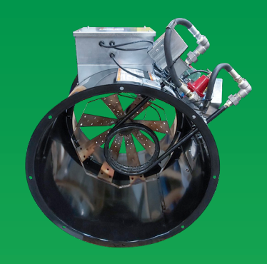
High temperature downstream axial heater