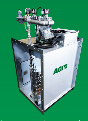
High temperature downstream heater