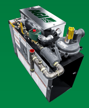
Low temperature downstream heater