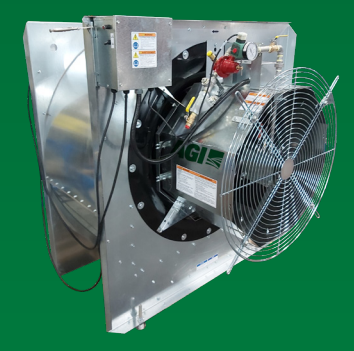
Low temperature upstream heater